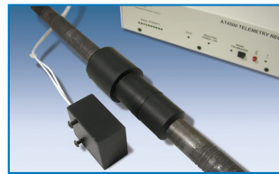
RT100D CV Shaft Application.

The RT100D allows the user to obtain an accurate and responsive torque measurement from a variety of prop and CV shaft designs without modifying the existing powertrain. The RT100D eliminates the need to weld or "cut in" heavy, in-line torque sensors that drastically effect the torsional dynamics and critical speed of a drive shaft. Inductive power is supplied across a generous air gap for reliable all-weather performance.